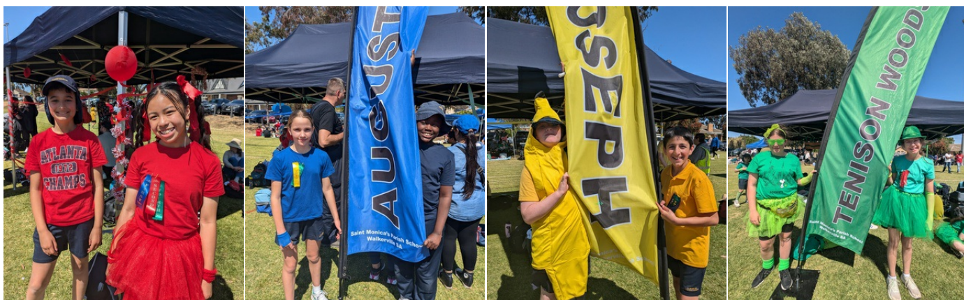
Team Cup Winners - Tenison Woods

It was an absolute pleasure to spend the last day of Term 3 with you at our School Sports Day. The community spirit and enthusiasm of the students were evident all day. I believe that this is the first time we have held our Sports Day on the last day of Term 3. I would be interested in hearing your feedback on this. If you would like to offer feedback on this arrangement, please email me at sharding@stmonica.catholic.edu.au by Wednesday, October 30.