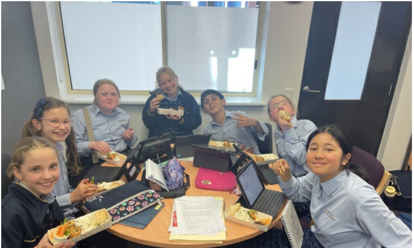
Little Lightbulbs Breakfast - Olivia Savvas MP

We wish them all the very best with at the competition on Sunday 10 September at Adelaide High School.