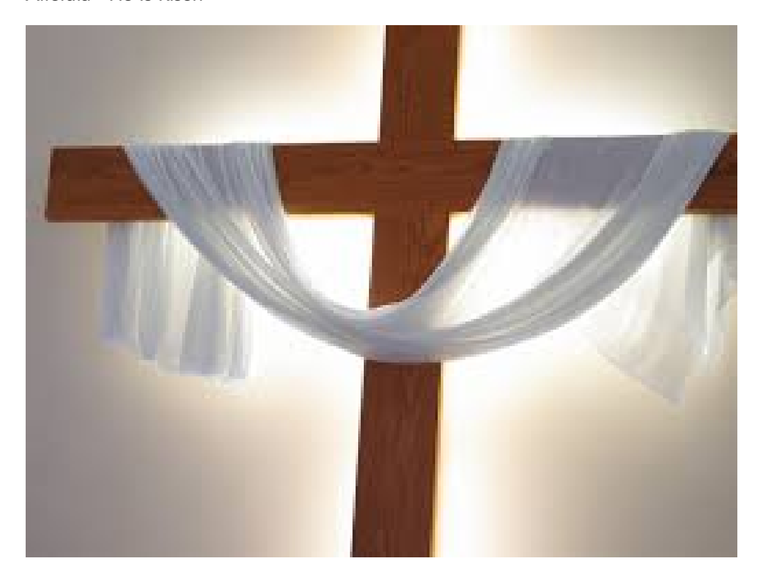
In the Catholic tradition, the season of Easter is celebrated for 40 days. Starting on Easter Sunday with the ressurection of Jesus